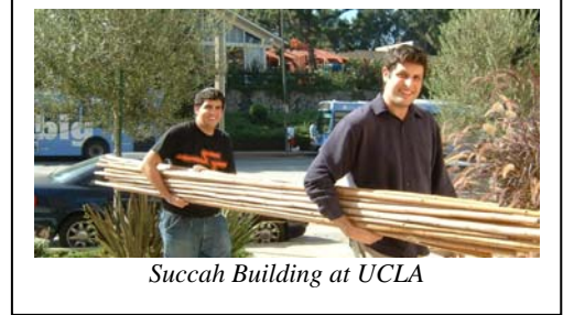
Sukkah Building at UCLA