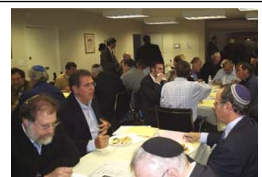
The crowd takes a dinner break