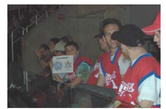
Yachad - having a great time! They even got to "high 5" the team into the stadium!!